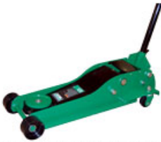
3 1/2 Ton Garage Jack